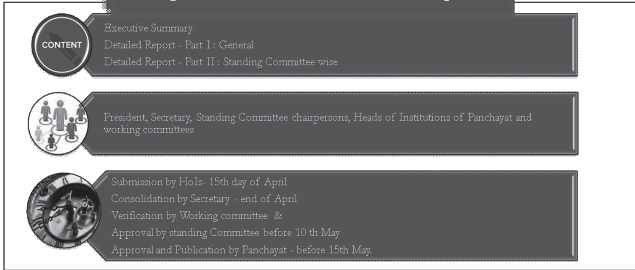
Figure 2 : Annual Administration Report

The mandatory chapters in the AAR of the Grama Panchayat are given below.